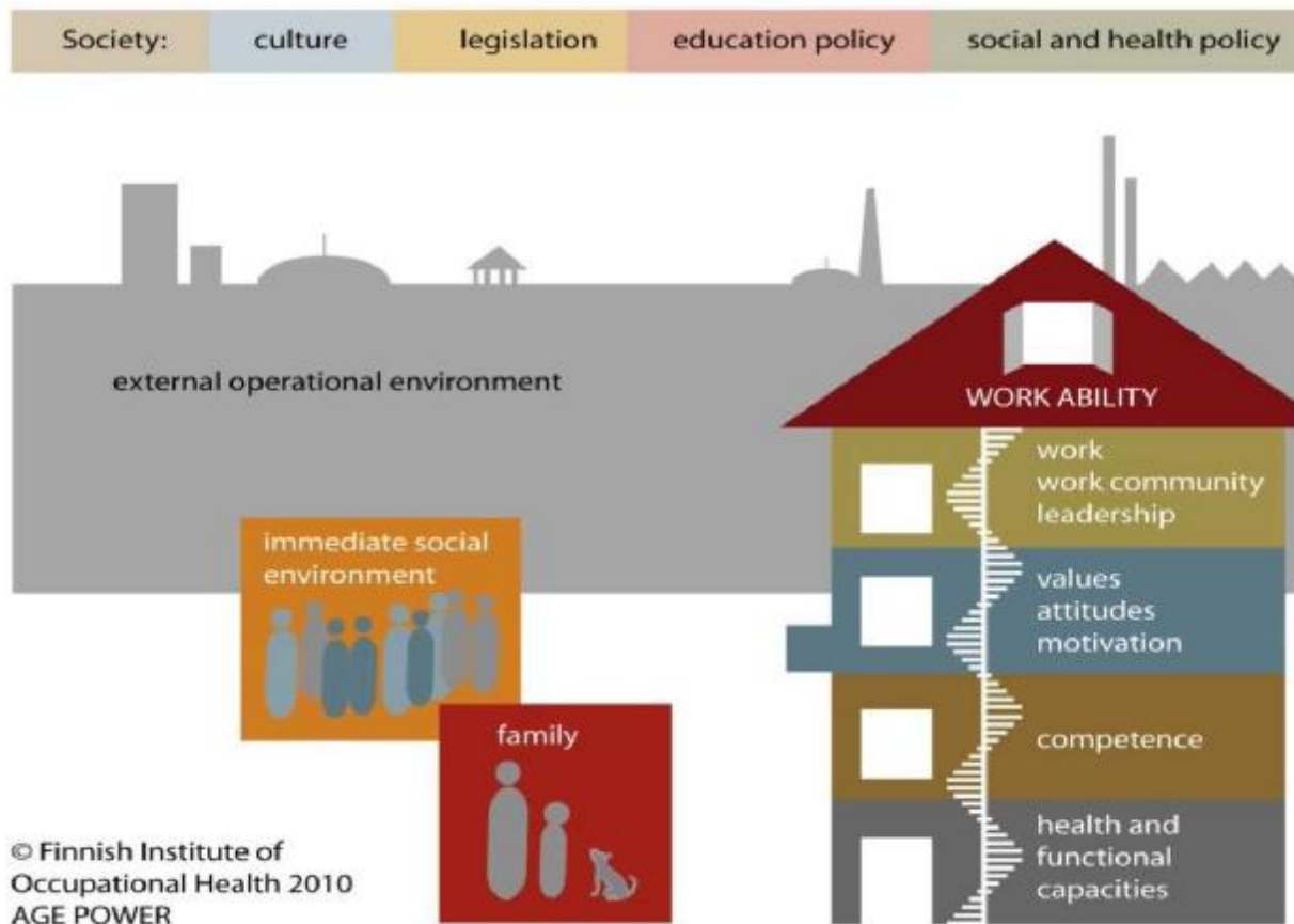
Figure 2: The house of workability (FIOH 2010)

While there is no singular definition of employability, a review of the literature suggests that employability is about: