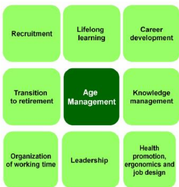
Figure 4: Prime dimensions of "age management"

"Age management's" prime dimensions can be seen in figure 4.