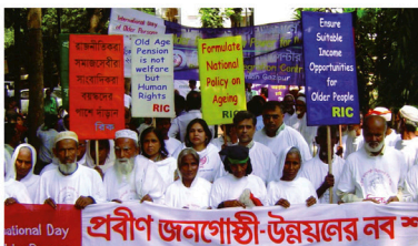
Lutz Leisering (Hg.)